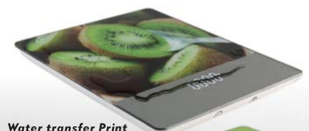
Water transfer Print