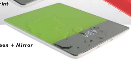
Silk screen + Mirror